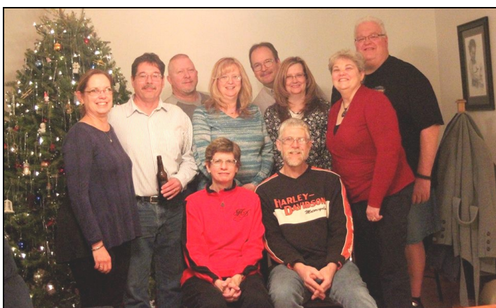
Ringin' in 2017 are some Mt. St. Clare Academy alumni from the Class of 1979!